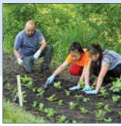
Page 3 Natural Resources Renewal